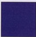
14. PURPLE Pantone No: 2607