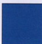
16. ROYAL BLUE Pantone No: 293