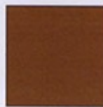
3. BROWN Pantone No: 469