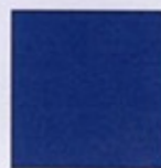
4. DARK BLUE Pantone No: 2767