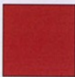
10. MAROON Pantone No: 201