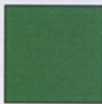
6. EMERALD GREEN Pantone No: 354