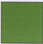
9. LIGHT GREEN Pantone No: 369