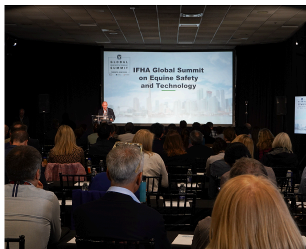
The Global Summit on Equine Safety and Technology was held this June

The IFHA is grateful for the support of Cornell University’s Harry M. Zweig Memorial Fund for Equine Research, The Hong Kong Jockey Club Equine Welfare Research Foundation, and Woodbine Entertainment Group, for the successful staging of the Summit.