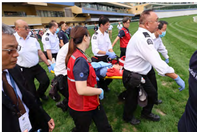
Participants got to observe live simulated events