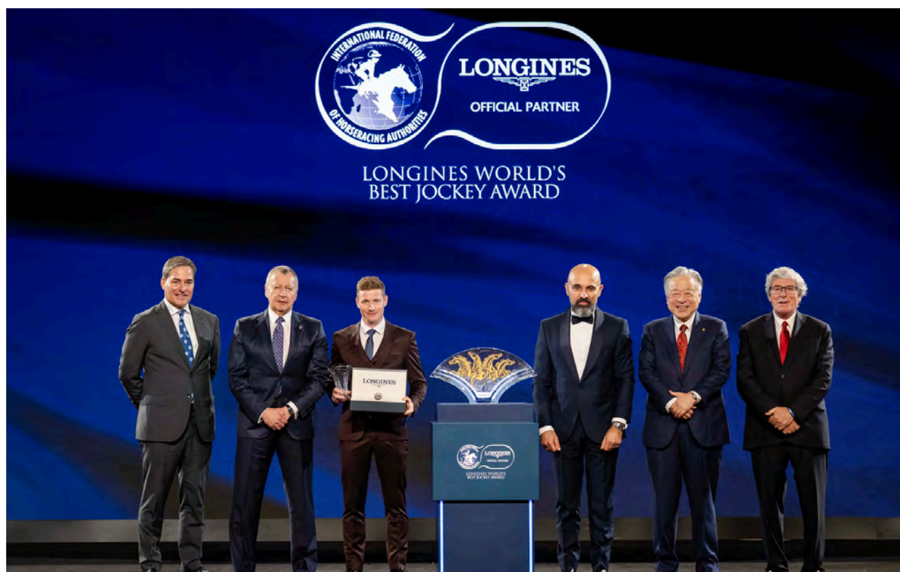
James McDonald was honoured earlier this month as the 2025 Longines World's Best Jockey by Longines and the IFHA