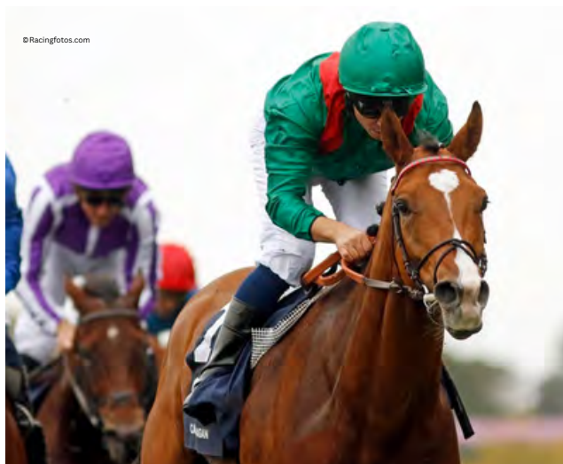
Calandagan leads the 2025 Longines World's Best Racehorse Rankings

(G1); Field of Gold took the St James's Palace Stakes (G1); Forever Young proved victorious in the Longines Breeders' Cup Classic (G1); and Sovereignty claimed the DraftKings Travers Stakes (G1).