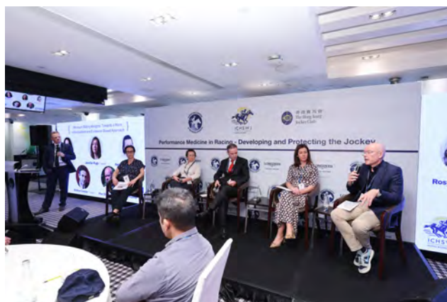
The conference featured 13 unique sessions