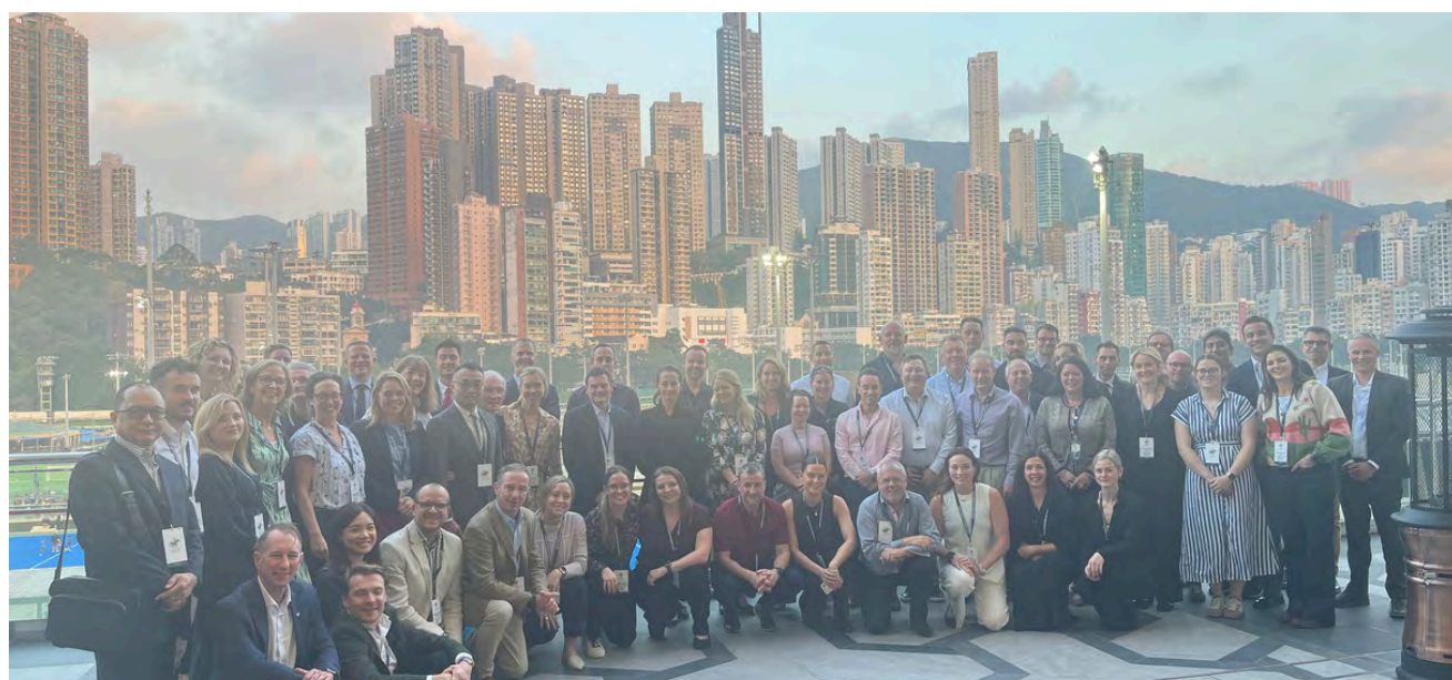
The 2025 International Conference for the Health, Safety and Welfare of Jockeys (ICHSWJ) was held 11-12 December in Hong Kong

The ICHSWJ was last held in October 2023 in conjunction with the 57 th International Conference of Horseracing Authorities and other associated meetings around the Prix de l’Arc de Triomphe weekend.