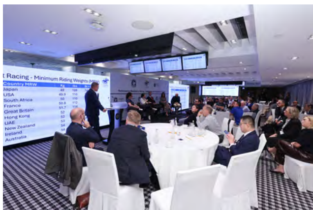
An applied, evidence-based approach featured throughout