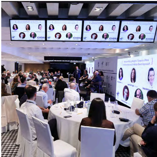
Over 100 attendees took part in the two-day conference