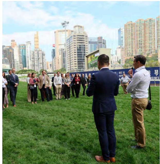
The event took place at Happy Valley Racecourse