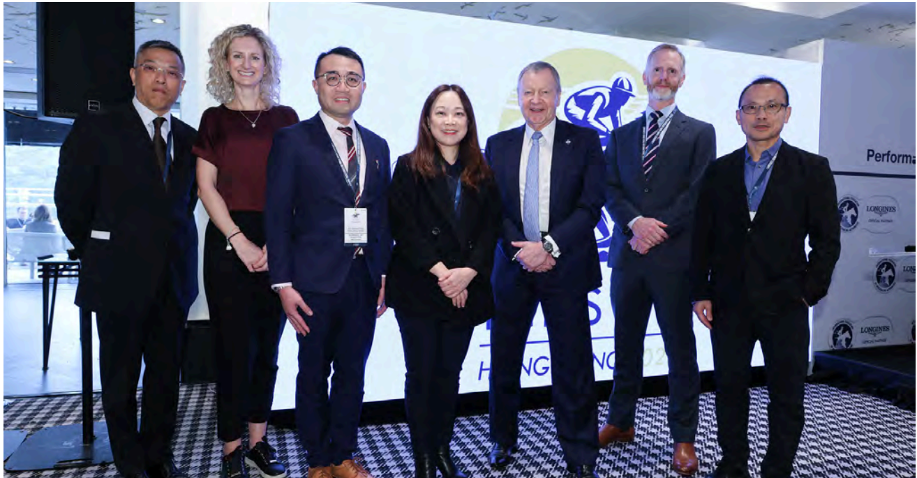
The 2025 ICHSWJ was organised by the Jockeys Health and Wellbeing Committee of the IFHA and proudly supported by The Hong Kong Jockey Club (HKJC)